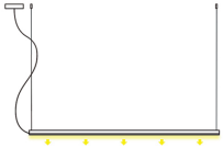
Kito c direct